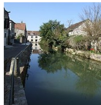
The Serein river runs through the town of Chablis, with many of the region's most prestigious vineyards planted on hillsides along the river

The advocates of oak in Chablis point to the positive benefits of allowing limited oxygenation with the wine through the permeable oak barrels. This can have the effect of softening the wine and make the generally austere and acidic Chablis more approachable at a younger age.