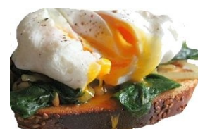
Poached Egg & Spinach on Toast