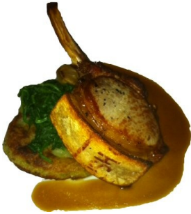
LOIN OF PORK WITH PAN FRIED BUBBLE AND SQUEAK, SMOKED BACON JUS AND CLOVE STUDED APPLE